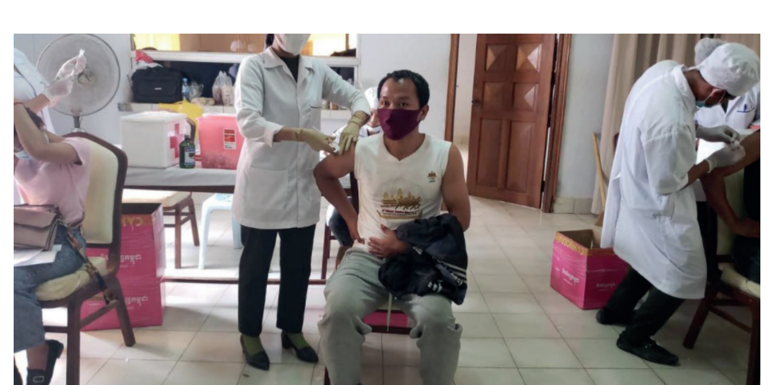
Saoyin vaccination, one of our teachers

Rather than locking down entire communes, the government is now closing individual households and sometimes villages. In brighter news, the vaccination drive has been completed in Phnom Penh and has just begun in Siem Reap. It will take some time for everyone to get vaccinated and reach max immunity, but there is a sense of hope that perhaps schools can open in the near future.